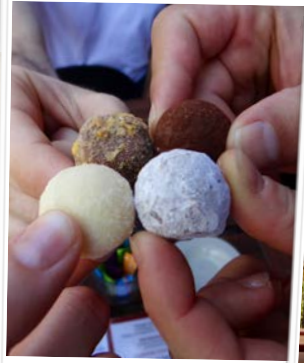
Cheers! A delicious praline for everyone from the Chocolaterie at Staufenberg Castle.