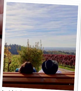
Just let the autumn sun shine on us and enjoy the beauty of the area.