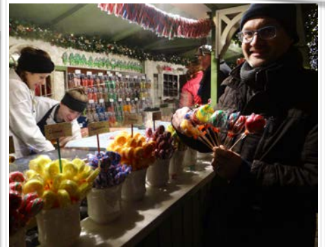
Kiel: One of many huge Christmas markets we visited this year. Someone has to watch that Ad-vent isn't becoming just an E-vent...