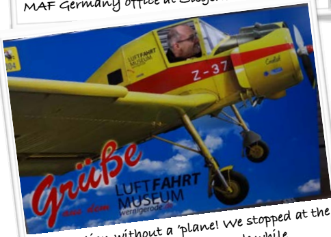
No vacation without a 'plane! We stopped at the aviation museum in Wernigerode while enjoying two days in this idyllic town in the Harz mountains.