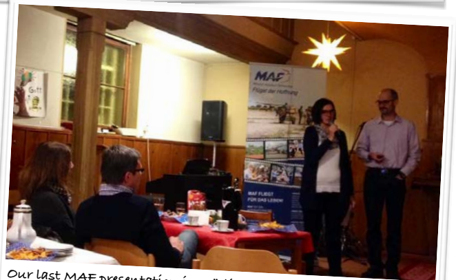
Our last MAF presentation in Görlitz under a traditional Herrnhut poinsettia and with delicious Christmas cookies.