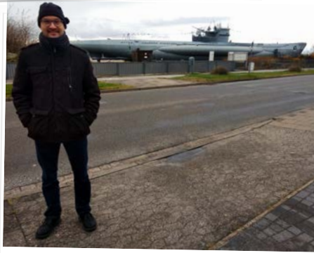
Submarine and marine monument in Laboe. One week M & M time in Germany's North..