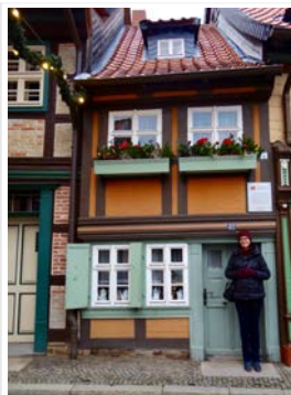
This house at Wernigerode doesn't have quite our 'collar width' or door height!