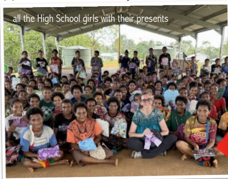
all the High School girls with their presents