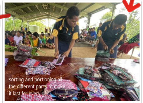
sorting and portioning all the different parts to make it last for every girl

Mougulu: We had brought 20 kilos of reusable sanitary pads from Germany, carefully and lovingly sewn by women from our church in Karlsruhe. After our farewell, all the girls from Years 9 to 12 stayed behind, and together with some extra supplies Sally still had, there were just enough for every one of them. It became a good opportunity to talk about womanhood and menstruation, about hygiene, sexual responsibility and school rules — and also simply to remind them that they are precious in God's eyes.