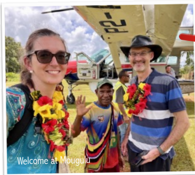
Welcome at Mougulu