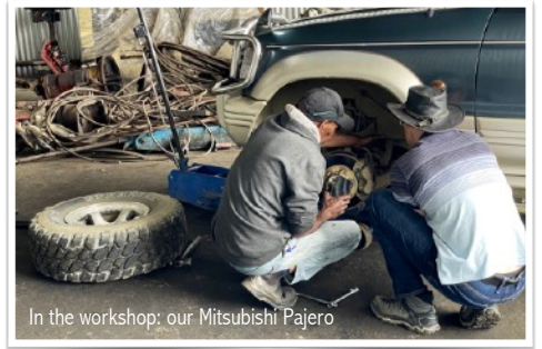
In the workshop: our Mitsubishi Pajero

set up an easy-to-use platform, which made our household clearance work really well. We photographed every single item, put a price on it, and uploaded it to a private online shop for sale. Local and international colleagues, as well as mission friends, were able to shop online from us. We are especially glad that this helped an Austrian doctor's family get started and set up their new home in PNG. It not only helped us financially but also emotionally to know our stuff still get used and reminds people of us.