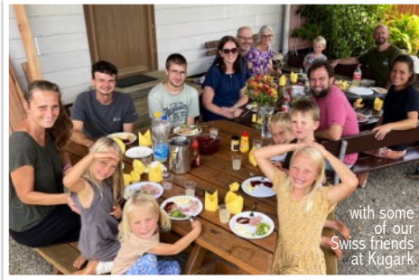
with some of our Swiss friends at Kugark

Because of our delayed departure, that is exactly the kind of stress we found ourselves under!