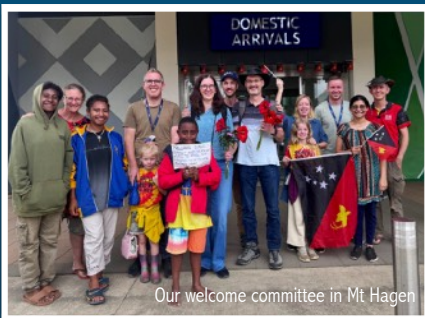
Our welcome committee in Mt Hagen

And yes, after a lot of back and forth, and after carefully weighing up the enormous additional costs, as well as the purpose and value of the trip, we were finally able to fly to PNG on 5 March — this time via South Korea.