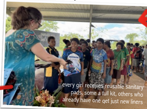
every girl receives reusable sanitary pads, some a full kit, others who already have one get just new liners